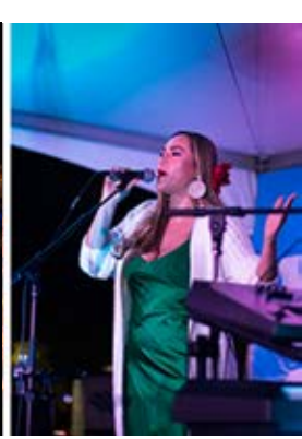
Canal Convergence 2023.